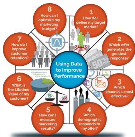
Figure 2. Significance of data for performance improvement [9]

As databases construction and adjustment are crucial in marketing actions, it is of key importance to analyze the technology influence to the creation of databases, data analysis, and marketing decision-making.