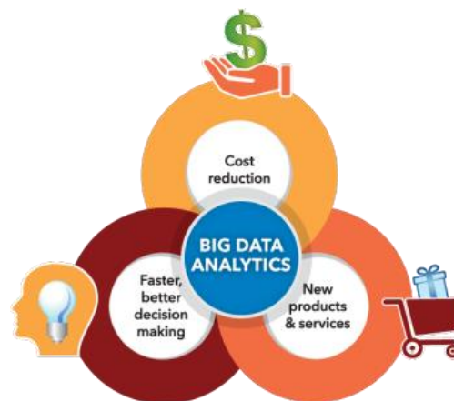
Figure 3. Big data analytics in marketing [14]

incorporating large volumes of data in real-time and their processing almost immediately. There are certain requirements regarding IoT databases, such as: scalability, ability to ingest data at sufficient rates, flexibility, fault tolerant, high availability, integration with analytics tools and costs [12]. The IoT inclusion enables smarter insights through the use of additional data from smart devices. The additional benefit of IoT is smart messaging or the realization of the new omnichannel world for consumer engagement [13]. However, the storing large amount of high-velocity and high-variety of consumers' data in the databases doesn't do much. The gathered data must be processed in appropriate manners so that the marketers may learn more about the customers and make decisions and actions towards the achieving higher companies' performances. The rapid progress in technology enabled the utilization of various Big data analytic techniques that contributes to getting valuable insights in easier and faster manners. The improvements in Big data analytic tools and computer algorithm and capacity enable faster discovering hidden patterns and problem-solving, knowledge obtaining and automatic recommendation system generation what significantly contributes to company cost savings (Fig. 3) [5, 14].