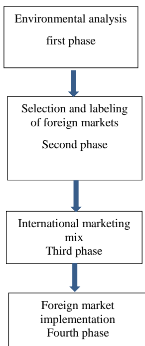
Figure 1. Research and conquest of niche markets